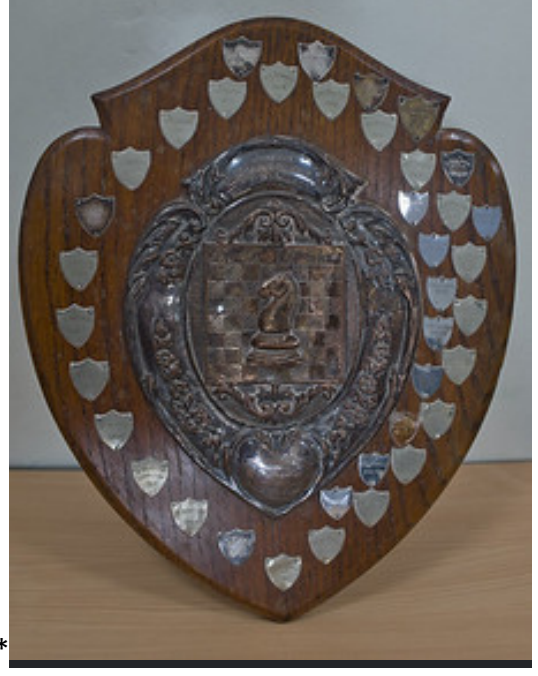
Under 16 Shield