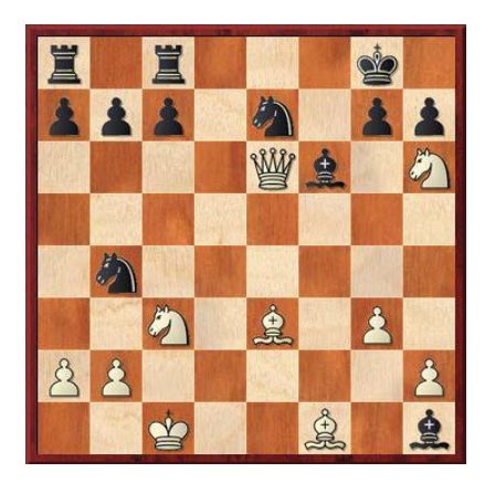
1-0 25...Kh8 26.Qg8+ Rxg8 27.Nf7mate

I felt there must be a forced win here and, after considerable analysis, suddenly realised that there is one after 21.Qg4 N6d5 22.Nh6+ Kh8 23.Nf7+ Kg8 Qe6 Nxe7 24...Bxe7 leads to the same fate. Mate could be avoided by 24...h6 but only with disastrous loss of material 25.Nh6+